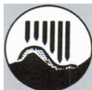
Scraping off welding splatter.