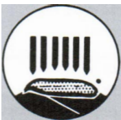
Cleaning up welding slag.