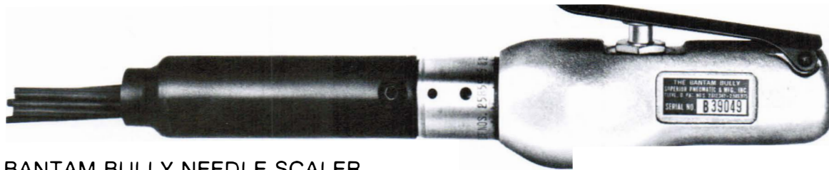
BANTAM BULLY NEEDLE SCALER STRAIGHT HANDLE MODEL 95511