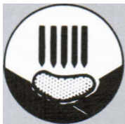
Cleaning structural steel before painting.