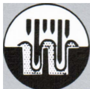
Removing sand from castings.