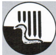
Scaling welded corners.